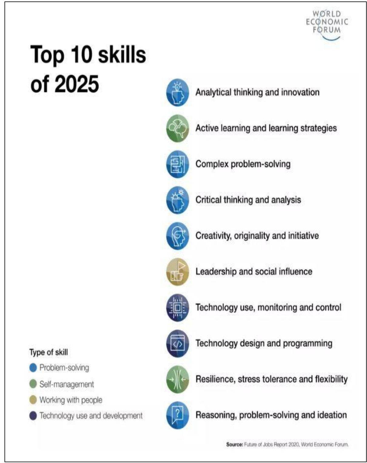
Figure 1: Skills towards the future