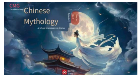
Figure 3. The video TV series "Chinese Mythology" generated by the entire process of AI

(https://baijiahao.baidu.com/s?id=1794208782938500249&rcptid=15746505146729316756)