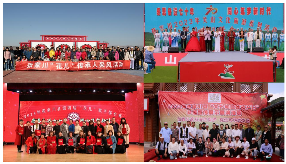
Figure 3: Zhangjiachuan Hua'er Government Practice

cultural image, affirm self-national identity, augment national pride, and enhance its overall international competitiveness. Gaining global recognition and prestige through our traditional cultural resources is a strategy of modern national power(Interviewee: Local scholars-I09)." In this context, the political implications of protecting traditional folk culture by the modern nation-state have been elevated to a "State" concern in terms of "promoting China's national culture." The local cultural authorities leverage this as a means to showcase the local government's efforts in safeguarding folk culture on behalf of the nation, while simultaneously achieving the objective of establishing a cultural symbol for the region and fostering local economic development.