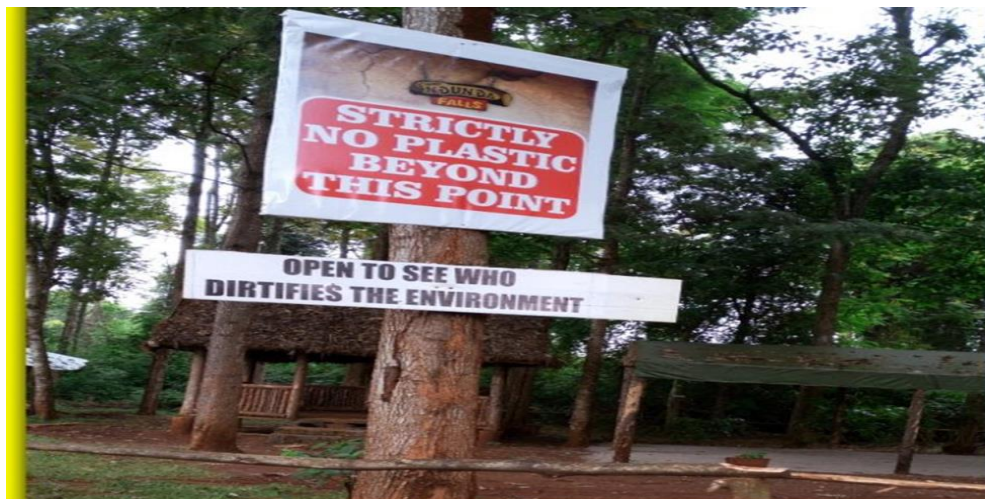
Figure 3: Environmental sustainability practices