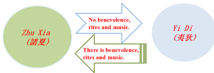
Figure 3: The transformation of Yi and Xia in the Spring and Autumn Annals

Therefore, the practice of etiquette, music, indoctrination and benevolence is the fundamental criterion for realizing the distinguishing Yi and Xia. In the 12th year of Duke Xuan's reign, Jin was defeated by Chu in the battle of Bi (邲). When the Spring and Autumn Annals were written, Jin's great physicians did not write down their titles but only their names, whereas Chu was called "Chu Zi". According to Dong Zhongshu, Duke Zhuang of Chu was able to show his virtues and had the credit of a gentleman, so he should be promoted to be a member of Zhu Xia, so he was called "Zi" and regarded Chu as one of the members of Zhu Xia. In the battle of Bi, Jin was deposed as Yi Di, while Chu became a gentleman, and the relationship between Zhu Xia and Yi Di was completely reversed.