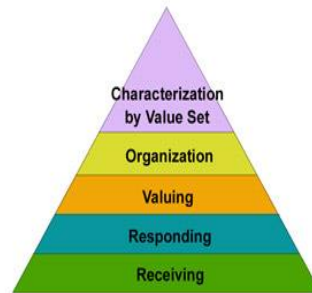
Figure 3: Affective Domain by (Krathwohl et al., 1973).

or commitment towards the phenomenon. At this level, the customer can accept, complete, defend, describe, or follow what he or she thinks is the best condition. Next, the customer will try to organize responses to the phenomenon. The customer will alter, arrange, combine, order, prepare, relate, or modify the choices that have been made. Finally, the customer has to characterize the value. At this level, it will show whether the customer acts consistently with the new value or remains with the choice that was made before. Figure 3 shows an Affective Domain by Krathwohl et al., (1973).