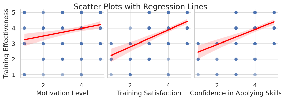
Figure 3. Scatter Plots with Regression Lines

Here are the scatter plots with regression lines for each predictor variable against the dependent variable, "Training Effectiveness". These plots visually demonstrate the relationships between each of the independent variables (Motivation Level, Training Satisfaction, Confidence in Applying Skills) and the dependent variable: Motivation Level vs. Training Effectiveness: Shows a positive trend, suggesting that as motivation increases, perceived training effectiveness also tends to increase, although the correlation is moderate. Training Satisfaction vs. Training Effectiveness: Displays a stronger positive relationship, indicating that higher satisfaction with training is strongly associated with higher perceived effectiveness. This relationship is the most pronounced among the variables tested. Confidence in Applying Skills vs. Training Effectiveness: Also shows a positive trend, indicating that greater confidence in applying what has been learned correlates with higher training effectiveness.