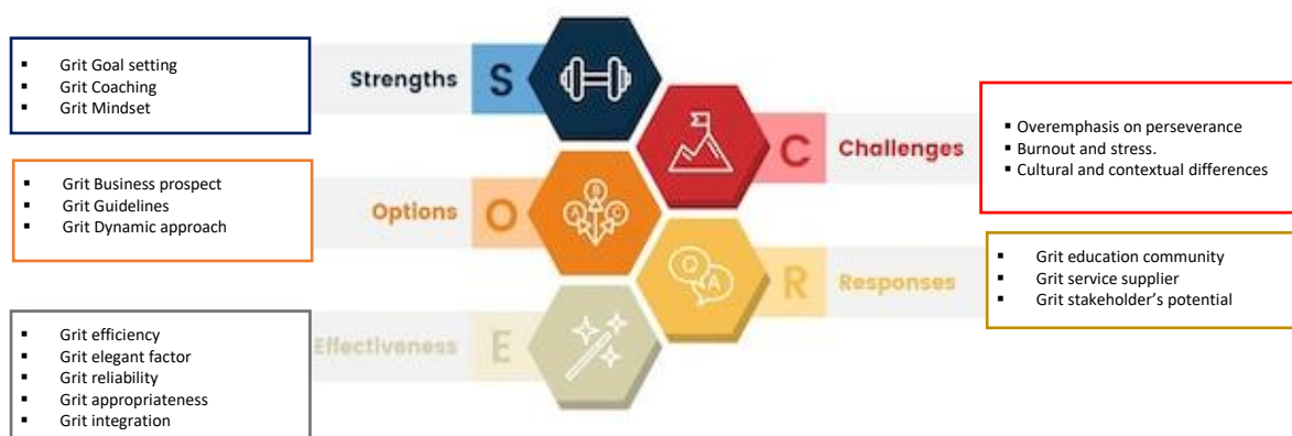
Figure 2: SCORE Framework Model on Grit

Figure 2 is the SCORE Framework Model on Grit that shows the aspect that needs to be empower by action taken from holistic approach. What we can learn from this framework is that the SCORE will help to monitor the development of grit in future especially for educational context.