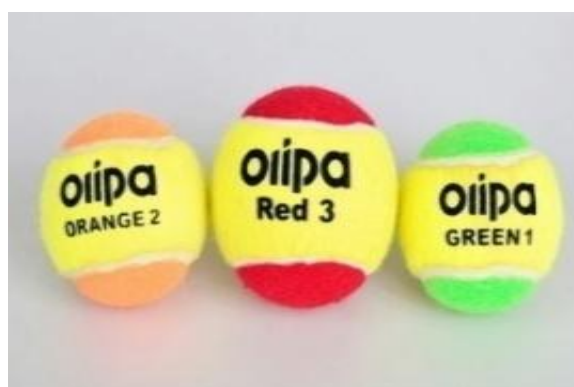
Figure 2 Short tennis Transitional tennis

b. Slow tennis ball speed: The short tennis ball is a lightweight sponge ball used to standardise the technical movements of children under 6 years of age. However, since the sponge ball is very different from the regular tennis ball, in order to be able to practice better with the standard tennis ball, a transition tennis ball (red, orange, green) has been developed for children aged 7-12 years old, which has a lower air pressure of 25%, 50% and 75%, respectively, so that it has more impact on the impact of the ball, which has more impact on the formation of the standardised technical movements (Yan, 2018).c. Small short tennis racquets : Short tennis racquets are similar in shape and material to traditional regular tennis racquets, but are lighter in weight and smaller in size, being 50-70% of regular tennis racquets in terms of weight and size. The weight of the racket is normally between 140g-220g(Wang, 2019).