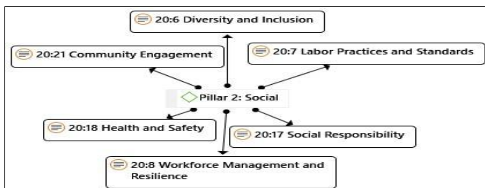
Figure 3. Common themes for social pillar