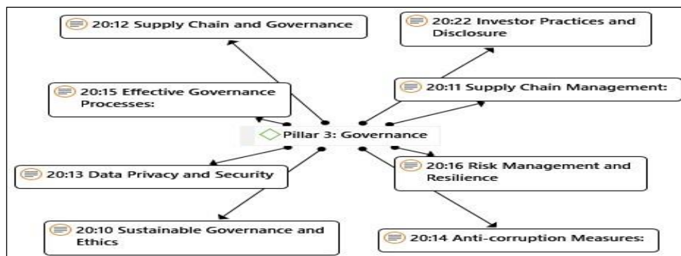
Figure 4. Common themes for governance pillar

Based on the thematic analysis, Pillar 1: Environmental has five common themes comprising of resource management, climate change mitigation, environmental footprint, resilient and adaptation, emissions reduction and pollution control. On the other hand, Pillar 2: Social has six common themes that are diversity and inclusion, labor practices and standards, community engagement, workforce management and resilient, social responsibility, health and safety. Finally, Pillar 3: Governance has eight common themes encompassing sustainable governance and ethics; supply chain management; supply chain and governance; data privacy and security, anti-corruption measures; effective governance processes, investor practices and disclosure, risk management and resilience.