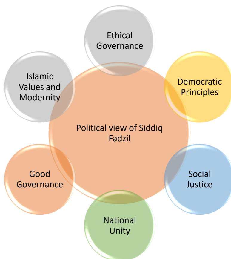
Figure 2 Conceptual Theory of Political View Siddiq Fadzil by Researcher

We need a new politics that accommodates both the great currents of democratization and Islamization. The two aspirations should not be allowed to collide and be destroyed by conflict (Fadzil, 2012). Furthermore, Fadzil (2022b) also The phrase religion covers the state (politics) needs to be explained to mean that religion (Islam) contains the texts of the Quran and the Sunnah regarding the principles and basic values of government (shura, justice, fundamental rights & equality), but not government about systems, institutions and political organizations.