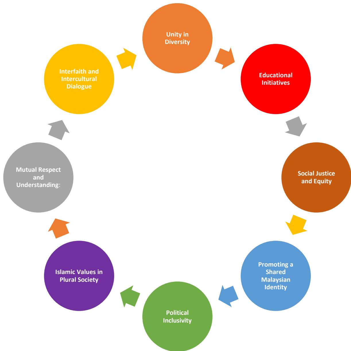
Figure 3 The Conceptual Theory of Society by Siddiq Fadzil

In summary, Siddiq Fadzil's vision for the art of plural society in Malaysia revolves around the principles of mutual respect, dialogue, unity in diversity, social justice, and inclusivity. His approach seeks to create a cohesive society where diversity is celebrated, all communities have equal opportunities, and a shared national identity is fostered. By advocating for these principles, Fadzil aimed to build a Malaysia that is harmonious, just, and united in its diversity (Fadzil, 2000b).