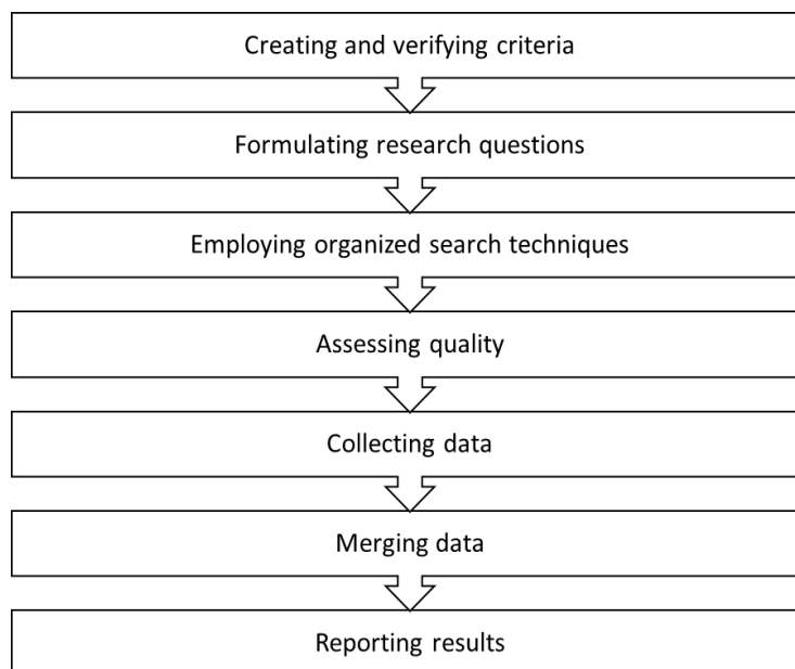
Figure 1. The ABC of systematic literature review