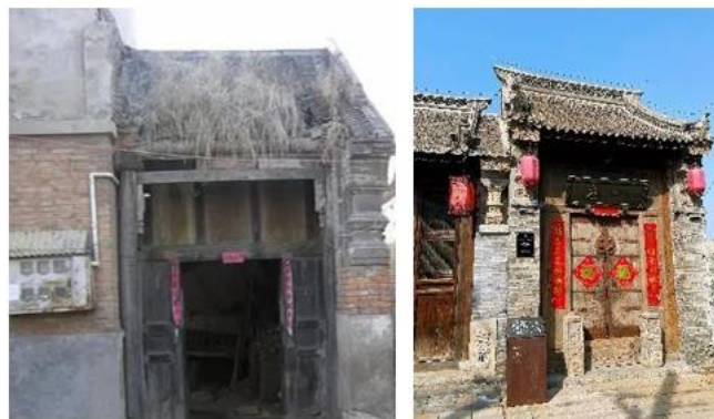
Fig. 6: Double Dragon Lane: A Case of Historical Preservation and Urban Renewal

Tourist 1 as a parent, believes that the uniqueness of culture is an effective way to enhance visitors' cultural experience by strengthening cultural education and allowing family members to understand and appreciate local culture. In the early days of Double Dragon Lane, residents had an impression of potholed streets and dilapidated old houses. In 2021, the Kaifeng Municipal government advocated the integration of historical and cultural elements into the whole process of urban planning and construction. Even though Adhika and Putra (2021) believe that cultural practices and tourism activities share space and may conflict. Double Dragon Lane, which was developed with the orientation of cultural landscape, retains the traditional architectural landscape form and changes the former residence of celebrities into a comprehensive cultural exhibition hall. The revitalization of Double Dragon Lane has preserved its historical architectural style while transforming it into a cultural hub for tourism and community engagement, shown in Figure 6.