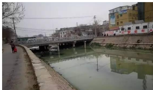
Fig. 7 Kaifeng River Before Restoration: Historical Documentation

Kaifeng has made significant efforts to revitalize its historical districts, particularly through projects such as the restoration of its river systems and the development of Millennium City Park. These initiatives aim to seamlessly connect scenic spots while enhancing the city's overall cultural identity. Our focus is to ensure that these developments are not just tourist attractions but vibrant, dynamic parts of the city".