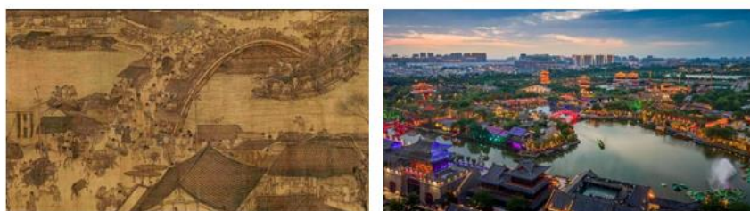
Fig 3: Recreation of Cultural Landscapes in Theme Park Development

The manager highlighted Kaifeng's dedication to preserving cultural heritage, as exemplified by the one-to-one restoration of Qingming Shanghe Tu (Along the River During the Qingming Festival) into a theme park. While not an original Northern Song Dynasty site, the park's design and cultural essence draw heavily from the legacy of that period, ensuring the experiential transmission of Song Dynasty heritage. This aligns with Olivadese and Dindo (2024) assertion that when effectively managed, cultural landscapes can serve as dynamic spaces for preserving historical narratives while fostering public engagement. By recreating scenes from the iconic painting, Kaifeng reinforces its cultural identity and provides a platform for visitors to engage with and understand traditional culture. As illustrated in Figure 3, millennium City Park recreates scenes from the iconic painting "Along the River During the Qingming Festival," offering visitors an immersive experience of Song Dynasty culture.