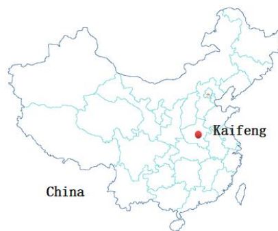
Fig 1: Kaifeng location of China