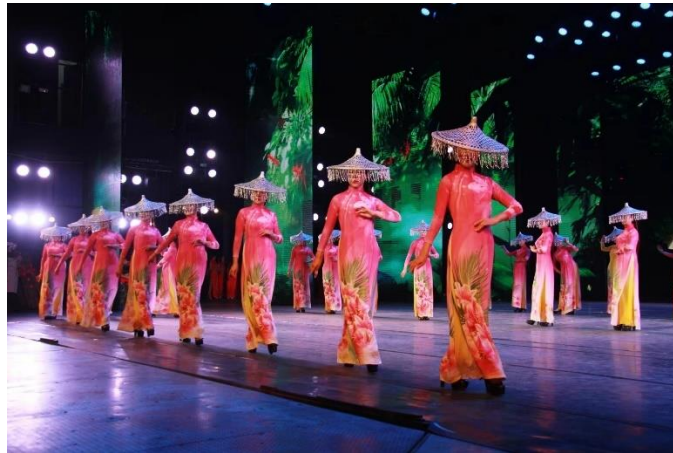
Figure 5: Volunteer-Led Cultural Exchange Programs Supporting Song Dynasty Heritage

and the restoration of ancient buildings. These activities help to enhance the sustainability of cultural heritage and expand community participation through cultural exhibitions and other forms, promoting more people's understanding of and interest in Song culture, thus promoting the cause of cultural preservation in local communities. This model of volunteer participation in cultural heritage helps to promote cultural preservation at the NGO level and promotes social concern for cultural heritage. Encouraging community involvement not only helps expand the organization's impact, but also provides audiences with a high-quality cultural experience, as shown in Figure 5.