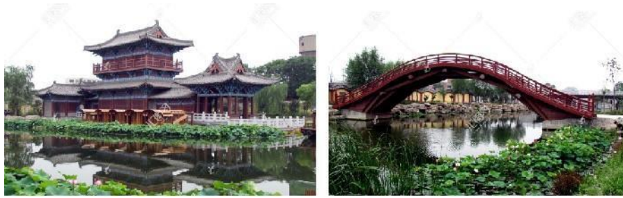
Fig. 8 Restored Traditional Architecture Along Kaifeng River

Explanation: Kaifeng's urban renewal initiatives, including the restoration of river systems and redevelopment of historical districts, exemplify the interplay between cultural landscape preservation and sustainable urban growth. Figure 7 shows the state of Kaifeng River before its restoration highlights the challenges of urban pollution and the need for sustainable landscape management. Urban renewal is inherently multifaceted, involving not only physical restoration but also the remaking of places to resonate with contemporary cultural and economic needs (Ujang & Zakariya, 2015). By integrating cultural landscapes into its renewal process, Kaifeng aligns with a culture-led urban renaissance approach (Hwang, 2014), where heritage preservation becomes a catalyst for urban regeneration. For example, the revitalization of the Old Town and its connection to surrounding areas through cohesive river system projects fosters a cultural bond between visitors and local communities, enhancing both the tourism experience and the city's livability.