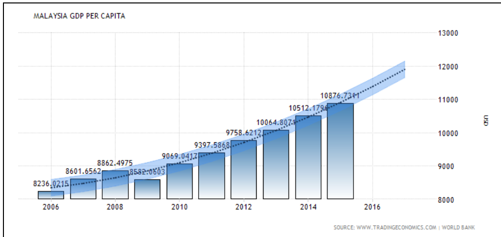
Figure 2: Malaysia GDP per Capita Between 2006 and 2016. Copyright 2016 by Trading Economics. Reprinted by Permission.