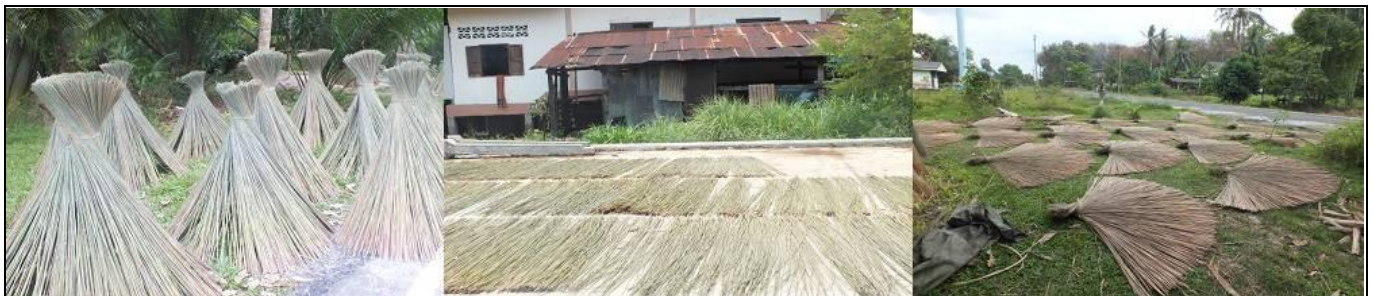
Figure 2. Sunning Krajoed

Flattening: Flattening the Krajoed can be done in a variety of methods (Figure 3), 1) Using a pestle to flatten the Krajoed is performed on a prepared flat surface and utilizing the pestle to level the stems and remove the sheath. The process is repeated until all the Krajoed has been flattened and the sheath removed. Using a pestle to flatten the Krajoed is time and labor consuming but ensures quality bands that is flexible, unbroken, not fractured and can be woven with ease. Using a pestle makes the highest burnished Krajoed than any other method. 2) Using a solid concrete roller with a (diameter about 14-16 inches and 30 inches long) to flatten the Krajoed. One handful of Krajoed takes about 20-30 minutes to complete where the