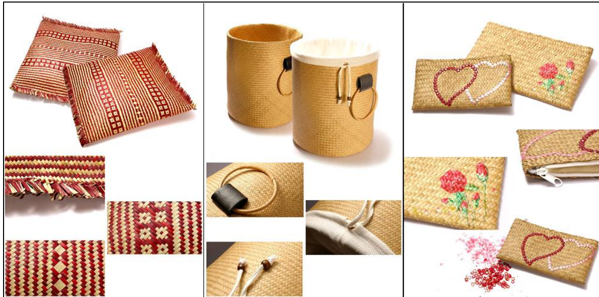
Figure 6. Commercial Krajoed handicrafts

requirements. Most products are created to follow consumer trends and patriotism where the products are designed for modern social applications and lifestyles. The handicrafts are produced with vibrant colors to create added value (Figure 6). 3) The market trend viewpoint is to develop quality Krajoed handicrafts and incorporate modern marketing techniques. Creative marketing is performed by utilizing network marketing and modern advertisement mediums such as radio, television, internet, brochures and pamphlet's to create product awareness so that consumers favor Krajoed handicrafts and realize their benefits in their daily lifestyles.