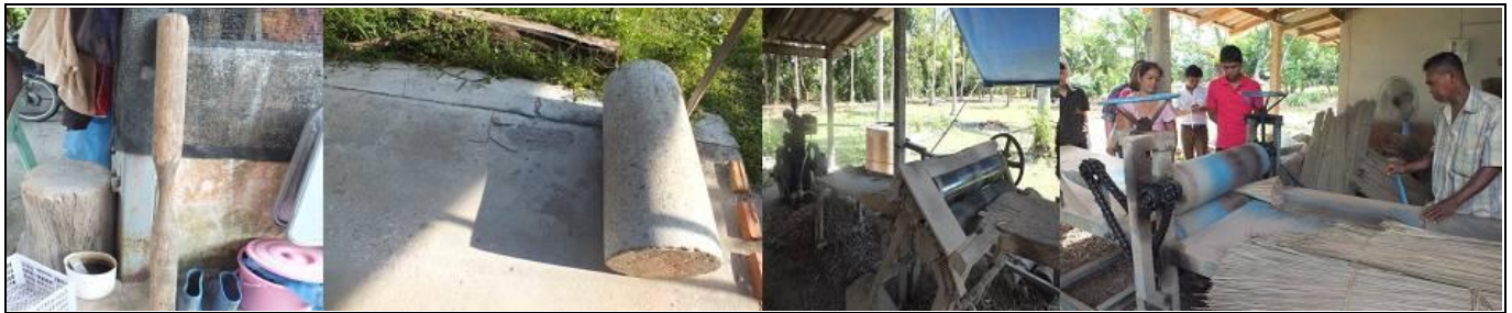
Figure 3. Flattening Krajoood

Dyeing: Dyeing Krajoood bands are performed to give the handicrafts decorative color and added value for consumers. Pre requisites before dyeing include cleaning and drying the bands. The steps in dyeing the bands are; 1) Choose dyes or pigments that are specifically for Krajoood, 2) The temperature of the water must be constantly kept at boiling point. The container must be made of stainless to prevent rust and discoloration of the dye. 3) Drying rack. 4) Plunger sticks to raise and lower the Krajoood into the dye formula. And 5) Water to rinse of the dyed Krajoood. The dye formula used by local communities diverges with each group having their own principle. The most effective formula is used by the Krajoood handicraft group at Ban Ton where the Krajoood bands never run and the colors never fade. Ban Ton's formula is that for 1 Kilogram of Krajoood requires 30 liters of water, 2 grams of salt or sodium chloride per 1 liter of water, dye or pigment in 3-4 percent of the water, the temperature of the water must be maintained at 100 Degrees Celsius and 3-4 minutes of dyeing time. After 3-4 minutes of dyeing, the Krajoood bands are submerged and rinsed in plain water and air dried. The final process is to press the bands before weaving.