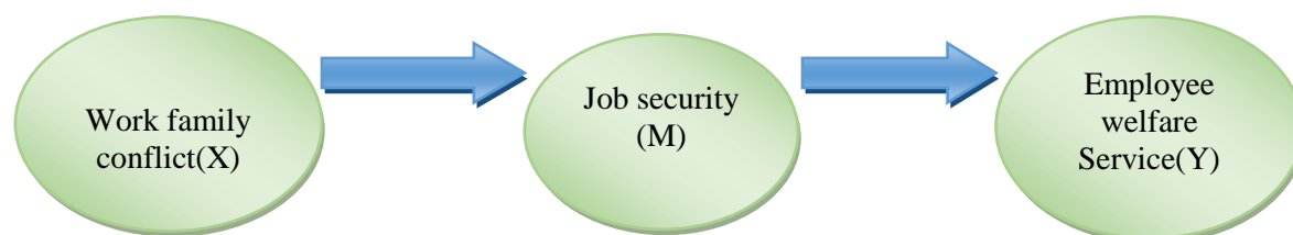
Figure: 1 THEORETICAL FRAMEWORK

*Aswathappa (2010) in his book, "Human Resource Management" discussed the different types of benefits and services provided to employee's in conditions of payment for time not worked, insurance benefits, compensation benefits, retirement fund plans etc. He also discussed the ways to administer the benefits and services in a superior way.