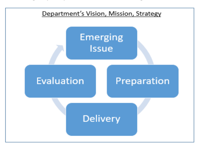
Figure 3. Research's stage based on adaptation process

Clearly the proposition of research question in this study is how the changing process of standard in auditing course learning process using Interactive Control System chronologically, the findings will give some contribution as described in research background section. The exploration objects area of this research would be explained through cyclic process as shown in figure 3.