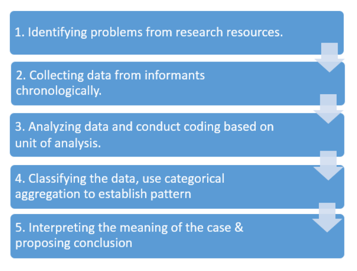
Figure 2. The Research's Phase