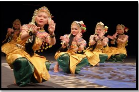
Picture 3,4: Wood carving motive as a structure in a Makyung Raja BesarHoGading design set.