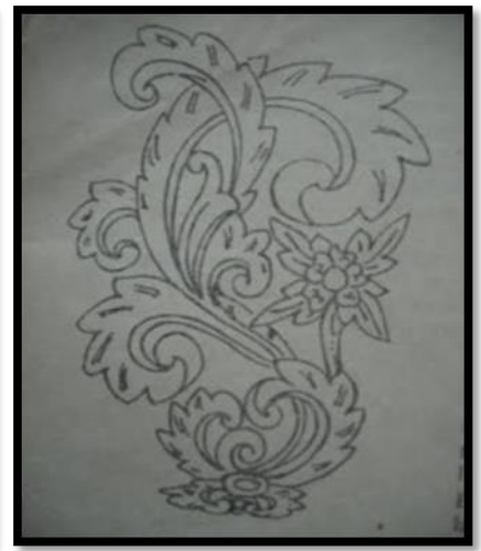
Picture 5,6: Wood carving motive as a movement in the Makyung Raja Besar Ho Gading design set.