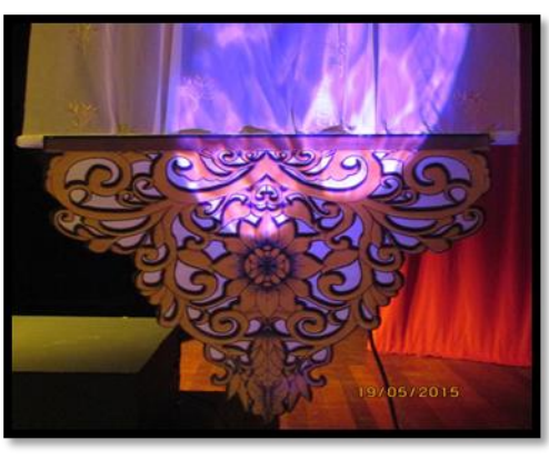
Picture 7,8: Traditional Wood carving on Malay house pillar.