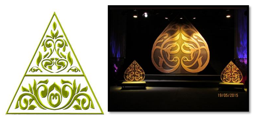
Picture 9,10: Shows the element of wood carving that uses the balance principle.