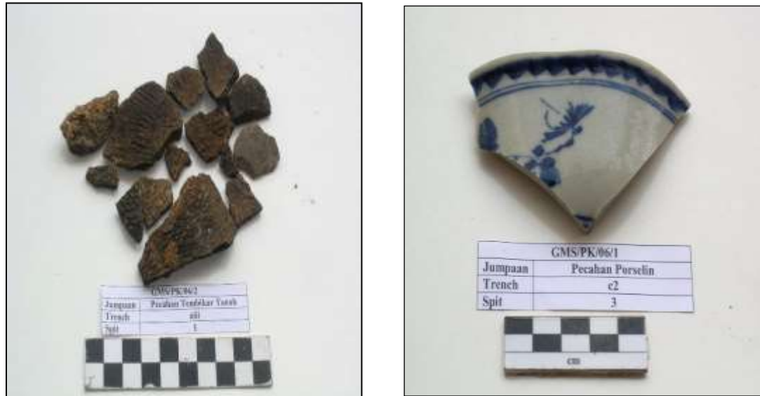
Fig. 3. Erthernware and Porcelin from Gua Mat Surat

Jusoh (2011) discussed the discovery of ancient paintings at Gua Mat Surat in Kinta Valley, Perak and the relationship with the ancient paintings discovered at Gua Kelawar, Ipoh (Taha & Jaafar, 1990). In addition, Jusoh (2011) mentioned the danger to the sustainability of the natural heritage of the limestone caves in Kinta Valley, Perak. In another article, Adnan Jusoh (2016) emphasized that the heritage sites (archaeological sites, historical buildings and natural sites) in Malaysia need to be fully explored so that they can be turned into archaeological tourist sites.