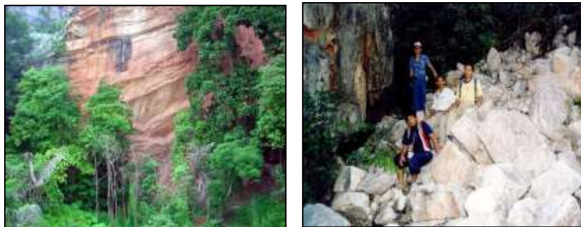
Fig. 4. Cave erosion and ruins at Gua Tambun and Gua Tanjung