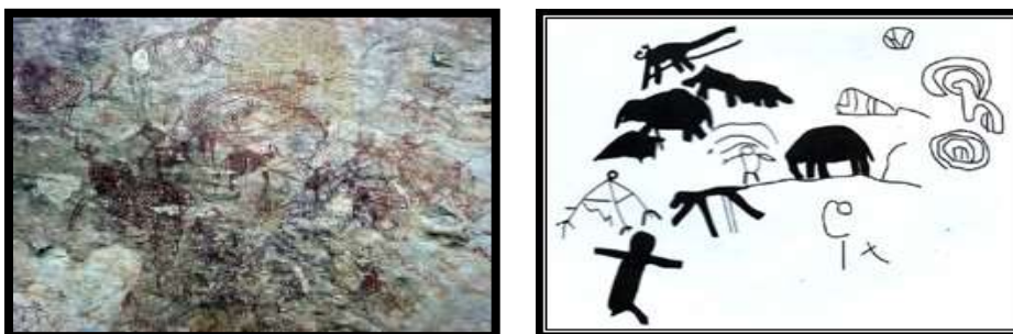
Fig. 2. Rock art at Gua Tambun and Gua Kelawar

In 1936, H.D. Noone and P.V.S. Callenfels conducted a study at Gol Bait, Sungai Siput, Perak. The study discovered pottery fragments within the upper layer (0-40 cm), consisting of pieces of the lips and bottoms of pottery. Among the functions of the pottery found in Gol Bait were water storage and food storage; a bowl used for ritual ceremonies in the prehistoric society was also found (Collings, 1938). R.L. Rawlings reported that the paintings on the limestone cave walls were images of human beings and animals (wild boar, tapir and dugong ), dots, lines in other patterns and abstract figures (Rawlings, 1959). Adi Taha and Zulkifli Jaafar conducted a study at Gua Kelawar and discovered rock tools, earth pottery, food residues and a cave painting using charcoal, which was the most interesting finding (Taha & Jaafar, 1990).