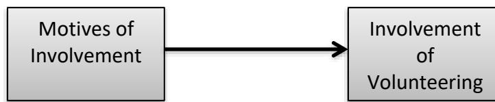
Figure 1.3: Conceptual Model on Relationship Between The motives of volunteerism involvement in the tourism sector.