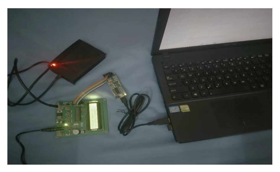
Figure 2: Connection to the PC

Purpose sampling was correlational studies minimum to obtain a good result is 30 respondents depends on the accuracy or desired error of the researcher and it was adopted from (Uma Sekaram, 2006). There were 30 randomly selected respondents as the questionnaire being distributed randomly to the staff UPSI as a respondents either at Kampus Sultan Abdul Jalil Shah (KSAJS) and Kampus Sultan Azlan Shah (KSAS). Data obtained was processed using Statistical Package for the