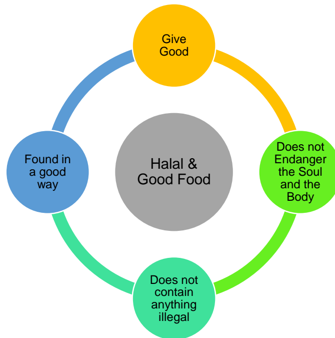
Figure 1: Halal and Good Food

Halal and good food is very much needed by humans. This halal food is a food that does not harm the soul and the body of the human being. There is also nothing in it that Allah s.w.t. has forbidden such as animal meat that is haram, carcasses, blood and so forth. Haram food is to safeguard the safety of those who eat it. Illegal food has a bad effect that causes Allah s.w.t to forbid man from eat it. This halal and good food also provides good and nutritious which will produce energy for the human body. In addition, the issue of halal should be taken into consideration from the beginning of the food processing itself.