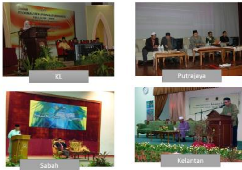
Figure 5: Fatwa Education Seminar/Discourse

a fatwa is issued. The seminar or discourse is also intended to provide an overview on current issues to avoid confusion in the community's understanding of legal issues while avoiding the public being affected by the views of certain parties. In fact, it also gives the public an opportunity to ask questions or concerns about direct legal rights. Fatwa education Seminar/Discourse is one of the best initiatives in distributing fatwas.