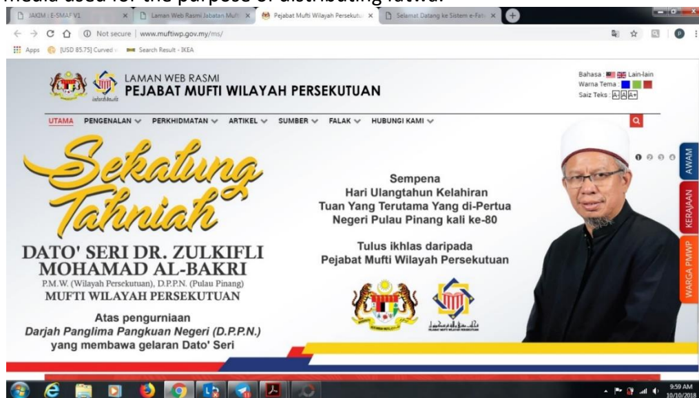
Figure 3: Mufti of Federal Territory Mufti Official Website

In addition, the Mufti Department in Malaysia also uses social media approaches in delivering or providing fatwa information to the public as it can provide space for the community to directly interact with the mufti department in asking the questions regarding the fatwa issued. This medium is a clear sign of the importance of social media as a medium of rapid information dissemination (Zain et.al, 2018). The diagram below is an example of the use of media used for the purpose of distributing fatwa.