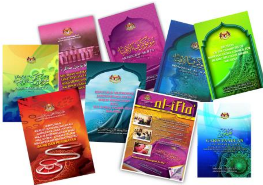
Figure 4: Example of Fatwa Publication

The publication of fatwas is one of the fatwa institution initiatives to facilitate the delivery of information as there are a handful of people who have no access to the relevant websites. With fatwa publications, it is easier for the public to understand the law of resolving issues without relying solely on the role of the media. Indirectly, it can increase the level of readability and knowledge of the society more widely and in detail.