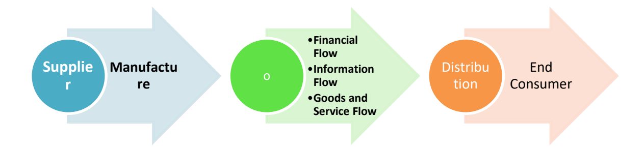
Fig. 2-1. Physical Supply Chain