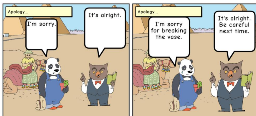
Figure 1: R1 and R2's comic creation for 'Introduction'

This comic was created at www.MakeBeliefsComix.com .