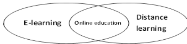
Figure 2.1 Distance learning and e-education (Fallon & Brown, 2003)

Distance learning is a system and process for connecting learners with distributed learning resources. The term distance learning is defined differently in each country. Therefore, there are many definitions of distance learning. What all of these definitions have in common is the fact that they are all about an instructive forms of work that is realized by writing, audio and video and computer technology. Process itself is shown to be very useful when it comes to establishing communication between students and professors in distance places (Fallon & Brown, 2003).