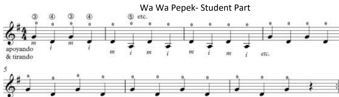
Figure 3: Sample of beginning level of student part

In the beginning, when mastered playing free strings technique, student will play on simplified Wa Wa Pepek song as the solo part with teacher accompanying as shown in Figure 3 and Figure 4 below.