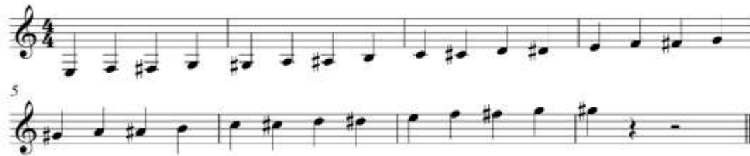
Figure 2: Shows all the notes that student will learn after completing the course.

Easy technical with a small range songs are included of the first chapters of the book, while more difficult and more voluminous ranges song are included in the final chapters.