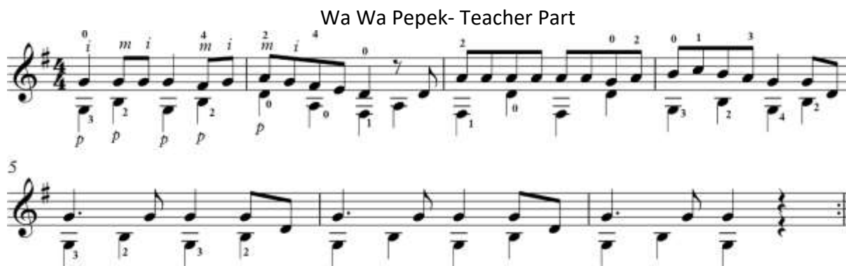
Figure 4: Sample of beginning level of accompanying part

The development in Chapter IV progressed where the roles will be more challenging. At this level, the student already started to play the actual melody oh Wawa Pepek song as solo part (Figure 5), and the teacher keeps harmony with chords accompaniment (Figure 6).