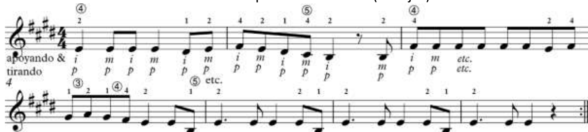
Figure 10: Wawa Pepek in E Major

Towards the end of this new method, there included songs with a more flexible rhythm, triplets and syncopation as seen in Chapter V. The example of the Malay folksong song used was Geylang Si Paku Geylang in B flat and A Major.