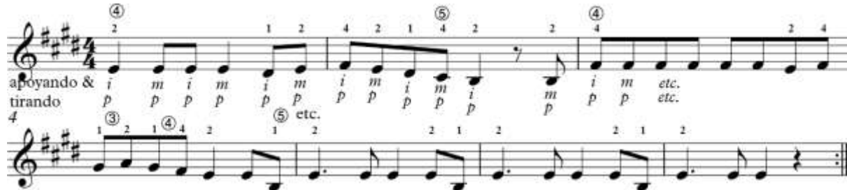
Figure 5: Sample of upper level of student part