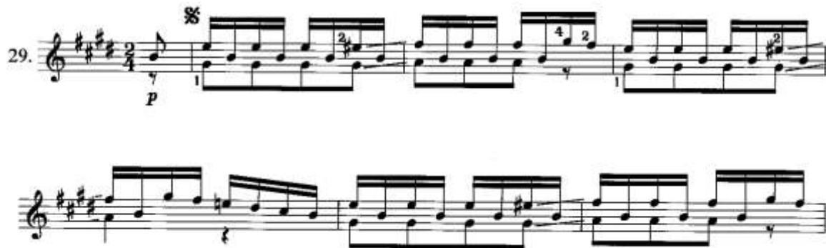
Figure 9: Example piece in E Major

Based on two examples in Figure 9 and Figure 10, from the book of Hector Thorlaksson, shows that the first piece is in C major and does not go beyond the first 4 positions of the guitar. In the last piece, is shown that the notes are the same, only into the fourth positions on the guitar, but here has a G sharp instead G natural, as it is in the piece Figure 9. Based on the example shows in Figure 10, the piece is already in E major, which is the key signature with 4 sharps. The first piece value of the notes is "eighths", then in the second it develops to "sixteen" notes value.