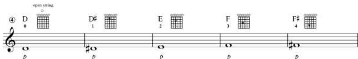
Figure 1: Sample of notes with their alterations- sharps or flats

Further, the contents of the book begin with Introduction, General note and then followed with the 7 chapters of basic guitar lesson. Chapter I has only exercises technique for right hand. There will be used for loose strings of the guitar. Based on the Bulgarian method introduced by Luben Panayotov, in the next 6 chapters (or 6 lessons), students will be eventually taught will all 6 strings and learned basic first four positions on the fingerboard of the guitar. Thus, releasing one lesson for each string, the student learns 5 main notes of a string fingering that is used while developing the technique of right hand apoyando and tirando , with alternating fingers. Novelty and diversity of the new Malaysian method here is that the students learn all the notes with their alterations- sharps and flats. This innovation is based on the knowledge of the students from their first semester, where they have been study theoretical subjects. In sequence, the lesson started from 4 th string, 3rd string, 5 th string, second string first string and the last sixth string passes through the main 4 positions on guitar and digested over 90% of the notes of the instrument.