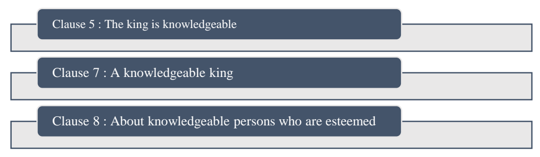
Table 2: Clauses about knowledgeable kings