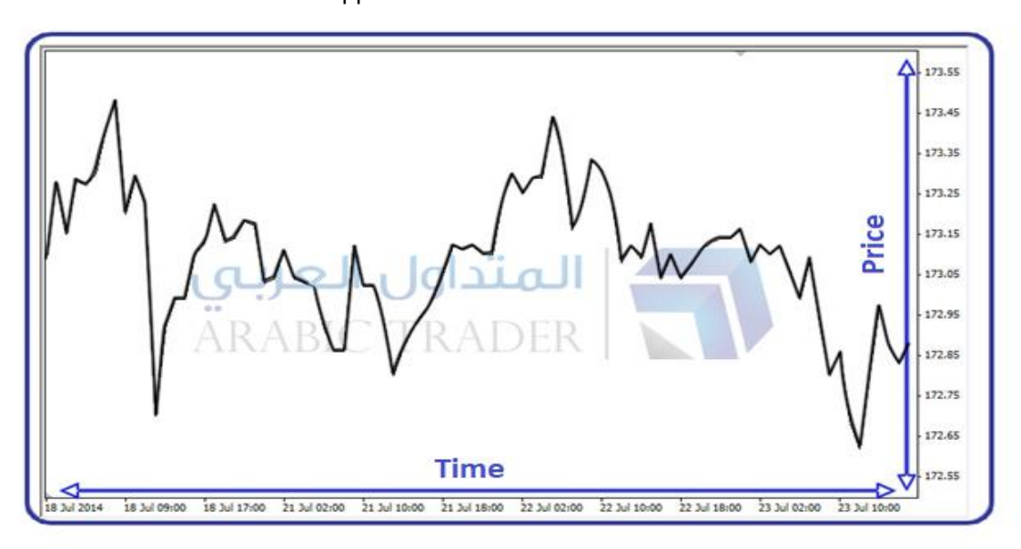
Figure 3. Arab Trader website

The levels Support and resistance are levels at which the trends of prices are expected to stop before it continues to move in the same direction or reverse from where it comes from, this happened because of the intensity of buying and selling transactions at these levels (Abu Tarboush, 2010). Figure 4 shows the levels of resistance and the levels of support as follows: