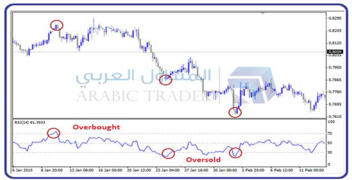
Figure 2. Arab Trader website

The RSI is used to identify the overbought and the oversold, the overbought means that the Stock Exchange protracted prices are moving to the upside, the oversold means that the Stock Exchange protracted prices are moving to the downside. The discoverer of this indicator, Welles Wilder, used the 30<sup>th</sup> and 70<sup>th</sup> levels as overbought and oversold levels and felt that they corresponded to the price movement, as they are shown in the Figure (2). If the RSI falls down the 30<sup>th</sup> level and then rises above it again, this is a strong signal that the buyers have returned to dominate the Stock Exchange and that is overbought, for that the price trend will continue rising up. While, If the RSI rose up the 70<sup>th</sup> level and then flown again, this is a strong signal that the sellers have returned to dominate the Stock Exchange and that is oversold, for that the price trend will continue going down.