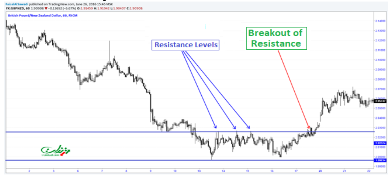
Figure 5. Trendaat website

If the level of resistance has broken, it means that the price will continue in the bullish trend for a long period. Hence, a stock buying decision has to be made because the price will rise up soon as shown in Figure 5. On the other hand, if the level of support has broken, it means that the price will continue in the bearish trend for a long period. Hence, a stock selling decision has to be made because the price will fall down as soon as shown in Figure 6.