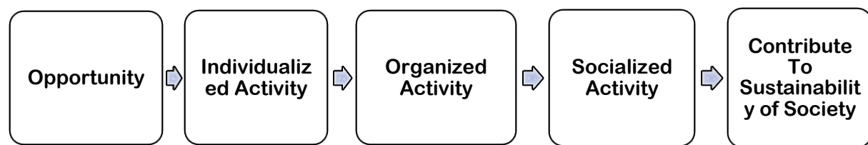
Figure 1: Five Stages of Social Entrepreneurship