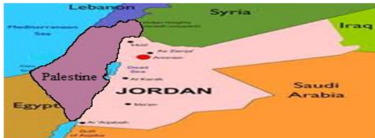
Figure 1.1: Map of Jordan

Jordan's population is around 6,249.0 million persons of which 3,221.1 million are males and 3,027.9 million females (DoS, 2011). Jordan is a sovereign Arab country and Amman is the capital. The Jordanian people are mostly Muslims and Arabic is the main mother tongue language.