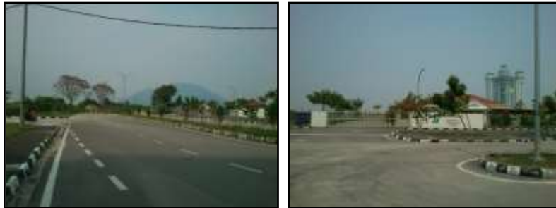
Photo 4. Cul-De-Sacs at North Area