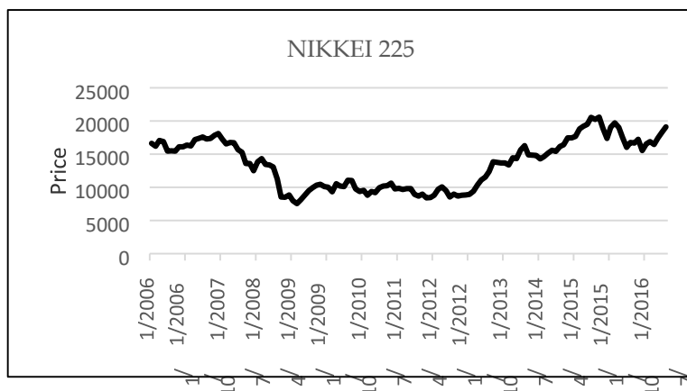
Figure 2. Japan Nikkei 225 stock index prices from January 2006 to December 2016

Figure 2, there are Japanese Nikkei 225 stock index prices from January 2006 to December 2016. At the beginning of 2016, the Nikkei 225 stock price index was worth $ 16,205 and then increased at the beginning of 2017, with a value of $ 17,604. After the increase, there was a downward trend in the price of the Japanese Nikkei 225 stock index to $ 7,568 in January 2009. Finally rebounded in 2013 with a value of $ 16,291 and experienced a peak increase in 2015. Research on the Nikkei 225 index is based on the object of research because the Nikkei 225 index issuers have a high market capitalization value and the oldest shares in Asia so that it better reflects the economy of the Asian region. Meanwhile the Japanese capital market Japan Exchange Group contains the Tokyo Stock Exchange which has dividend yield characteristics similar to the United States capital market (Rao et al. , 1992), besides that the Tokyo Stock Exchange is able to compare with the United States capital market about market sentiments (Ishijima & Kazumi, 2015).