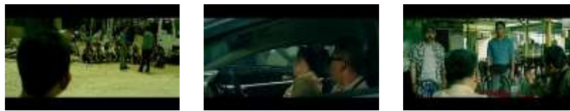
Figure 7: Scene about symptoms of immigrant entry without permits at (CR12J)

Based on the scenes in both films, this issue also highlight the irresponsibility and greed of the employers and local communities themselves who are not willing to venture into the field of work. As such, the influx of immigrants without a permit in Malaysia has created social and economic problems (Hee, 2015). Among other economic problems faced is the depreciation of the local currency due to the flow of money abroad. Meanwhile, social problems are reflected in the rising crime rates as a result of these groups, locals find it difficult to get a job.