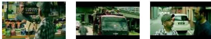
Figure 3: Scene corruption acceptance bribes shots based on Crossroads: One Two Jaga movie.