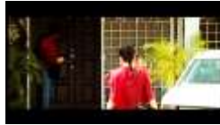
Figure 4: Scene a man receives the envelope from Shanti Father in the RIK movie.

In addition, the power of the political system has also resulted in scams. Nirwan Dewanto (Dewanto, 1994) stipulated that power is a complex strategy in society. Hence, every struggle to win requires deception in politics. This is clearly featured in the scene of the RIK movie when the character Teacher Shanti served as the Voting Agent and Vote Counting Agent (PACA). Teacher Shanti called out an illegal Bangladesh standing in-line to vote when he did not understand the Malay language (Figure 5) but the voting process continues regardless. In minutes 01:14:28 (Figure 5) scams like Selva disguised as a volunteer to bring voting papers away as directed by a particular party is also shown.