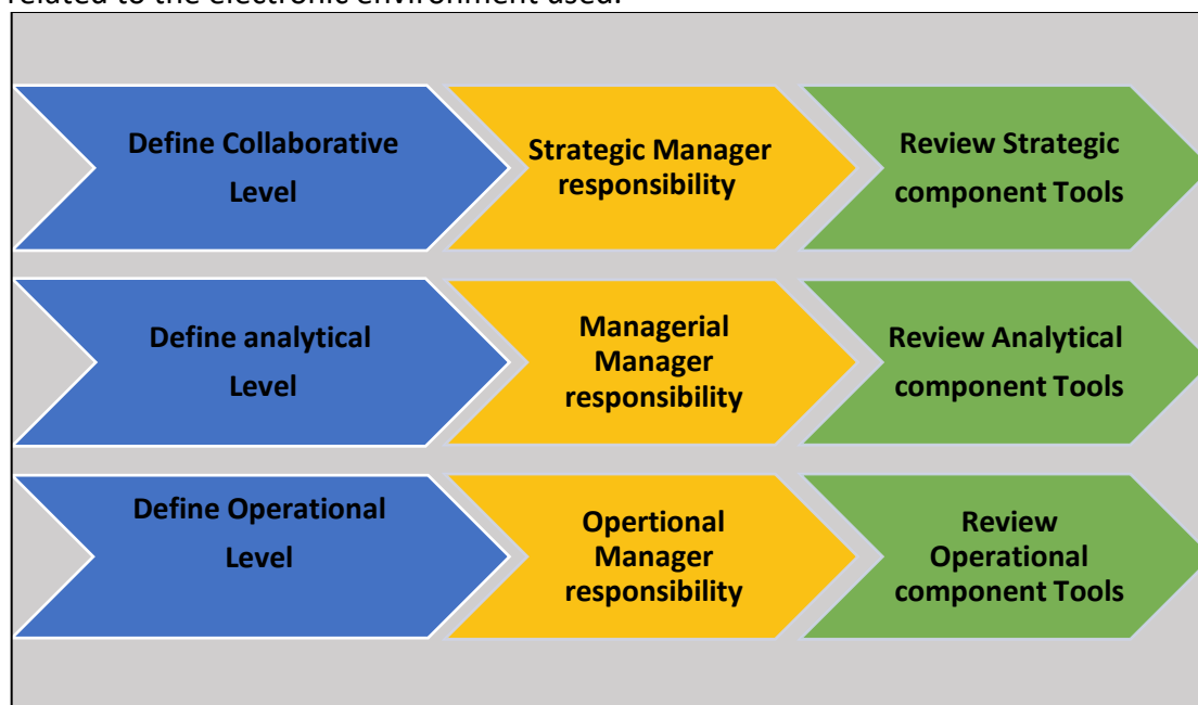
Figure 1: Model 1.E-CRM Strategy Level

Figure 1 shows the classification of E-CRM strategy level models. It shows how several levels are related to the electronic environment used.