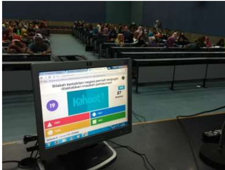
Fig 4 Classroom learning environment using Kahoot.it

The lectures delivered by ethnic relations specialists were also held to expose students with more in-depth and authentic learning on ethnic relations issues. For instance, in a teaching session, students are advised to attend a partnership session with an ethnic affiliation invited by the university (Figure 5). This approach is appropriate as it helps students to improve their understanding of community issues. In addition to sharing experiences related to ethnic relations, this approach provides students with the opportunity to raise questions and express opinions to the experts involved.