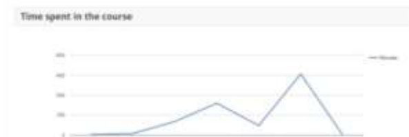
Fig. 9. Learning analytics in MOOC

In the final phase, the evaluation process by multidisciplinary partners is carried out to evaluate whether or not the results displayed in the video can solve community problems. Students conduct peer assessment using an online questionnaire (Google Forms). In the context of lecturers, they evaluate based on two methods; analyzing student engagement at MOOC through learning analytics on MOOC and involvement in social media through social network analysis on Facebook.