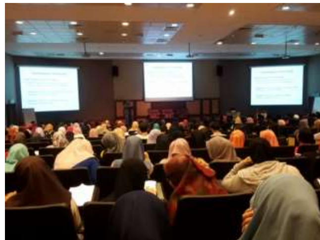
Fig. 5 Students attend a talk delivered by an invited speaker

The lectures delivered by ethnic relations specialists were also held to expose students with more in-depth and authentic learning on ethnic relations issues. For instance, in a teaching session, students are advised to attend a partnership session with an ethnic affiliation invited by the university (Figure 5). This approach is appropriate as it helps students to improve their understanding of community issues. In addition to sharing experiences related to ethnic relations, this approach provides students with the opportunity to raise questions and express opinions to the experts involved.