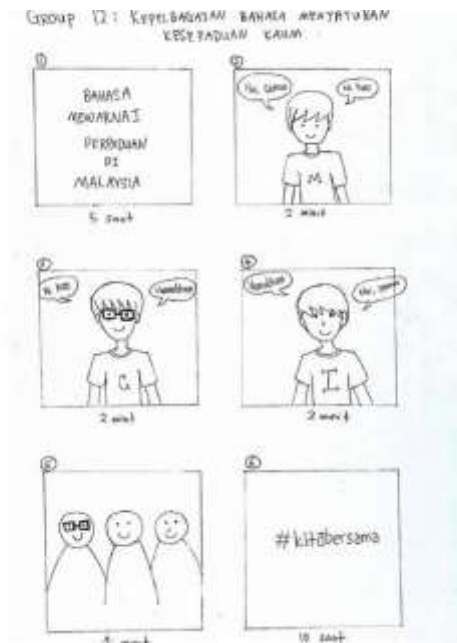
Fig. 6 An example of storyboard, generated in the analysis phase