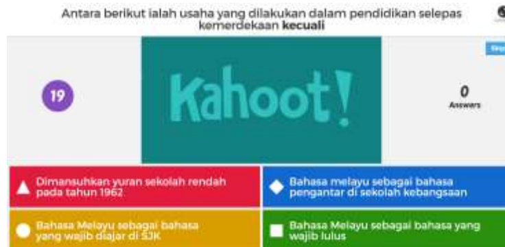
Fig. 3 Kahoot.it based learning

Kahoot is a quiz that is played using a mobile device connected to the internet. The lecturer will control Kahoot from one device (mobile or computer), which is connected to the projector to display the questions to students. Next, students will answer these questions using a device (mobile or computer). Scoring is given based on the accuracy of answers and response speed. The Kahoot system will display the highest scores (first up to fifth ranks) on the main display and will also display individual scores on their respective devices. Once the game is over, the score achieved by all students will be saved and recorded online which can also be exported to Excel format.