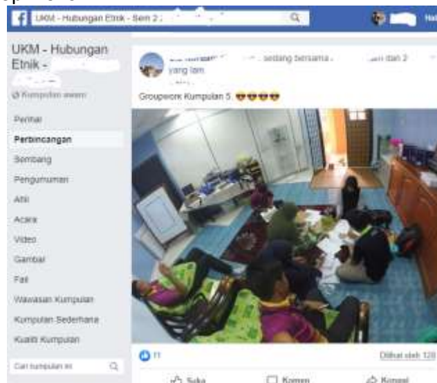
Fig. 8. A group of students uploaded a recording process related to group project topics through Facebook

In addition, the theory of ethnic relations learned can be applied to the real context. After performing a video recording, the student edits the video using various applications like iMovie and Adobe Premiere. Edited videos will be uploaded on YouTube and Facebook Groups to facilitate multidisciplinary learning partnerships. The application of social media in learning can increase informal interaction among students and subsequently produce more open-minded students in expressing opinions.