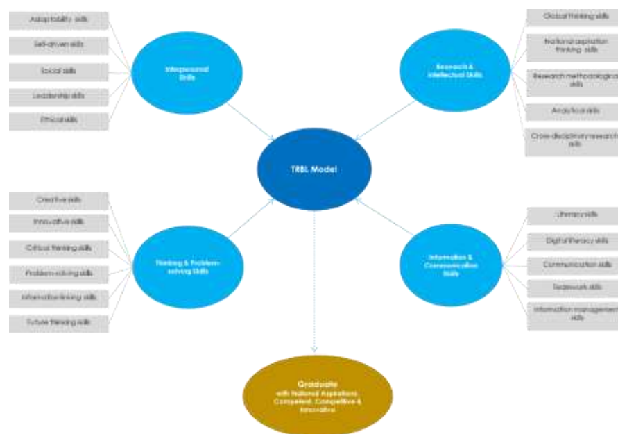
Fig 3: Transdisciplinary-Oriented Research-Based Learning (TRBL)

The TRBL model was developed based on the following studies: (i) transdisciplinary-nary research (Lang et al. 2012; Schneider & Rist 2013; Kagan 2015); (ii) 21st century skills (Partnership for 21st Century Learning 2015); (iii) learning strategy "Aalborg PBL Model" (Barge 2010); (iv) the concept of cultural research from Hanover Research (2014); (v) Education Development Plan 2015-2025 (Higher Education) (Ministry of Education 2015). This model is designed to help students in enhancing value-added skills in the future. The framework contains four main aspects - interpersonal skills, research and intellectual skills, thinking skills and problem solving, and information and communication skills. Each aspect contains elements and their descriptions as shown in Figure 3.