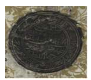
Figure 2: The seal used in Letters from Sultan Mahmud Riayat Syah from the state of Johor and Pahang was addressed to Governor-General Willem Arnold Alting dated 12 Ramadan 1211 or March 11, 1797.