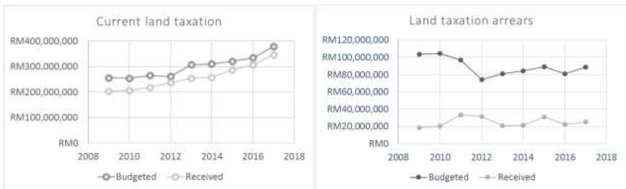
Figure 2. Graph trend of land taxation revenue in Malaysia for 2012 to 2017 (Adapted from the summary of financial statements and financial management of agencies,

Malaysia National Audit Department, 2018).