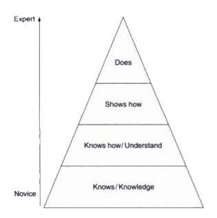
Figure 1: The Miller Pyramid and Prism

The proposed research framework for stock trading simulation in this study is adapted from The Miller Pyramid and Prism as shown in Figure 1. It shows the different levels in the perceptions of stock trading literacy with regards to the cognitive, affective and physical dimensions responded by the participants which occurs on the novice to expert continuum throughout the period of stock challenge / competition. It also includes an initial awareness level of stock trading which may underpin higher levels of stock trading literacy.