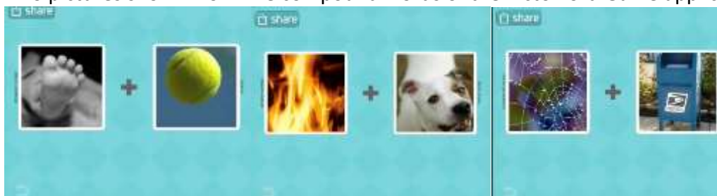
Figure 3 Two pictures shown from five compound words of the Pictoword Game application

From the figure, researcher can conclude that these ten words are familiar with the age of the research participants, which are in the range of 10 to 11 eleven years old. For example, hotdog, cupcake and corndog are light meal that they always eat. During the research period, corndog that originally a Korean styled food with 5.71% only two pupils got it wrong due to it is currently viral all over the places and the pupils knew about these foods from the social media. Moreover, ladybug, goldfish and jellyfish are animals, which they were familiar since kindergarten as introduction to know basic English words. Five pupils misspelled football even it is one of the famous sports in the world and in school none other than because they substitute or omit a letter might be due to anxiety and overconfident as they misspelled to foodball and footbal .