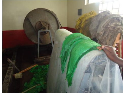
Plate 2: Fish-skin processing at KIRDI,