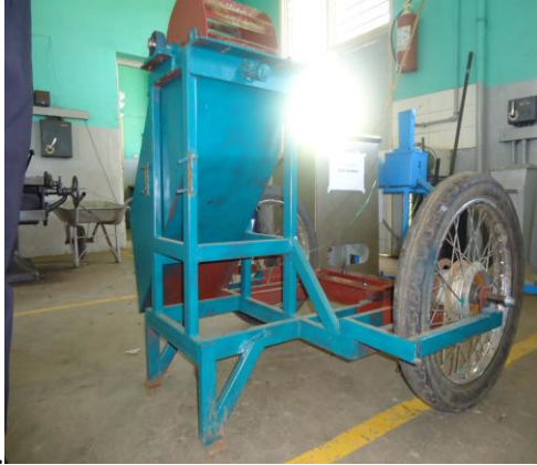
Plate 1: Sisal Decatometer -a research institute collaborative innovation product