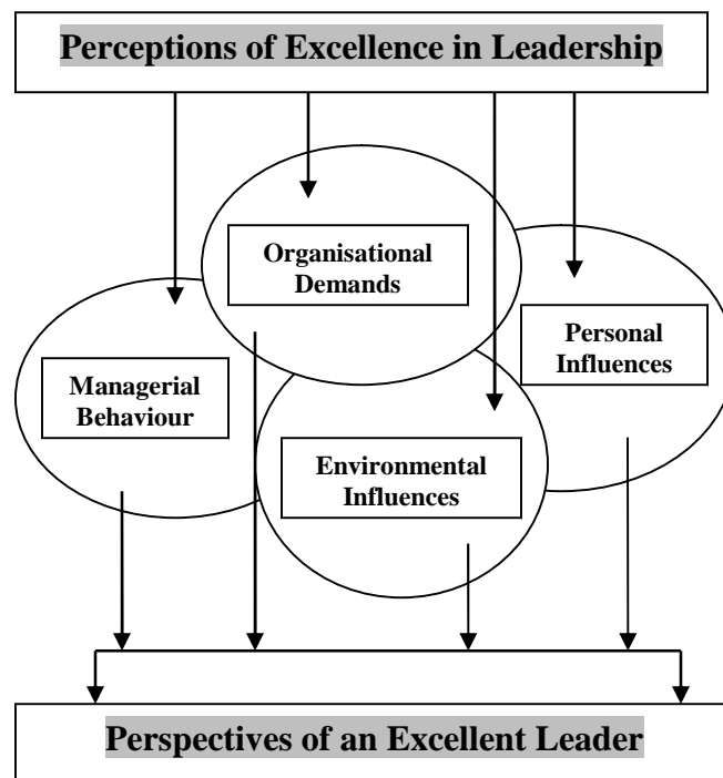
Figure 1. Conceptual framework for the study of excellence in leadership

Most studies have dealt mainly with national emphasis and have not seriously looked at sub-populations of the country as contributors to managerial values. In this paper, we are interested in the relationship between managerial values and how they contribute to leadership excellence and how these differ within Thailand between different demographic groups; such as age, gender and ethnicity. Culture in its manifestation changes over time and studies (see Ralston, Gustafson, Terpstra, and Holt, 1995; Selvarajah and Meyer, 2008c) have shown that generational differences affect value perceptions. Similarly, gender perceptions have been studied to determine women’s managerial behaviours (for example, Yukongdi and Benson, 2005). Increasingly, women managers are participating in larger numbers in Thailand than in many European countries. A UN survey of women in management and administrative positions worldwide placed Thailand, Singapore and the Philippines ahead of Netherlands, France and Germany (cited in van der Boon, 2003). In many countries of Southeast Asia, there are sizeable ethnic groups and this could affect leadership value perceptions (see Selvarajah and Meyer, 2008a).