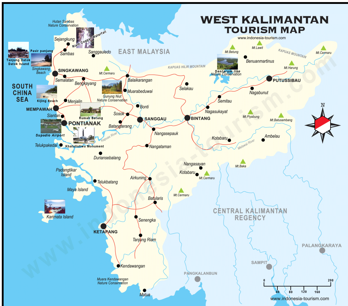
Figure 1. Map of West Kalimantan showing its capital city Pontianak and the town of Sambas in the north ( https://junglemaps.blogspot.com/2017/12/map-of-kalimantan-barat.html ).