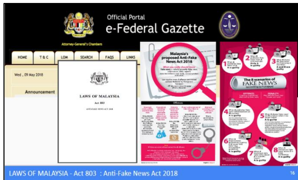
Figure 2: Official Portal for Anti-Fake News

Malaysian Government has taken initiatives to approve the Act 803 - Anti Fake News. The Government introduced this new legislation due to the issue of dissemination of fake news which is also a global problem, following the technological communication revolution, which is happening at a rapid pace. The bill, that will complement the existing provisions of the law, is aimed at protecting the public from fake news and, at the same time, ensuring that their rights to speech and expression under the Federal Constitution is respected. It expresses the government's commitment to address the dissemination of fake news due to the rapid and intensive growth of communication technology and regulates the dissemination of fake news in any medium of publication and it is not restricted to social media. The scope of this bill is extensive and exclusive to address offences pertaining to fake news thoroughly and effectively. Apart from a clear definition or illustration of what constitutes fake news, the bill also provides for punishment for those who fund the dissemination of fake news, not removing fake news when required, and others. At the same time, the bill also creates temporary measures to stem fake news while investigation and prosecution is being done.