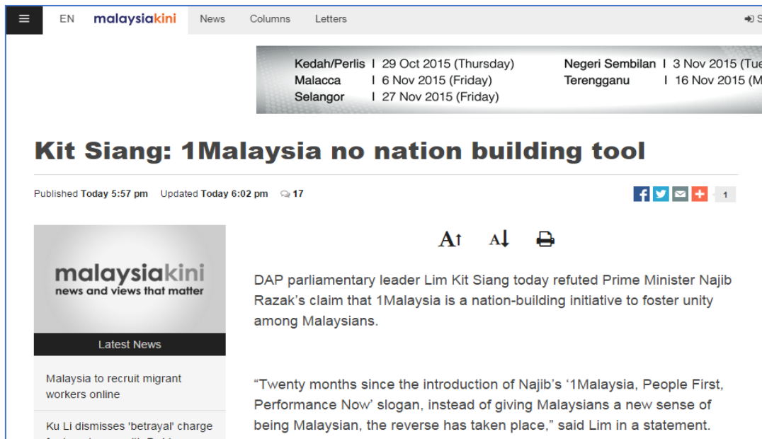
Figure 9: 1Malaysia is No Nation Building Tool