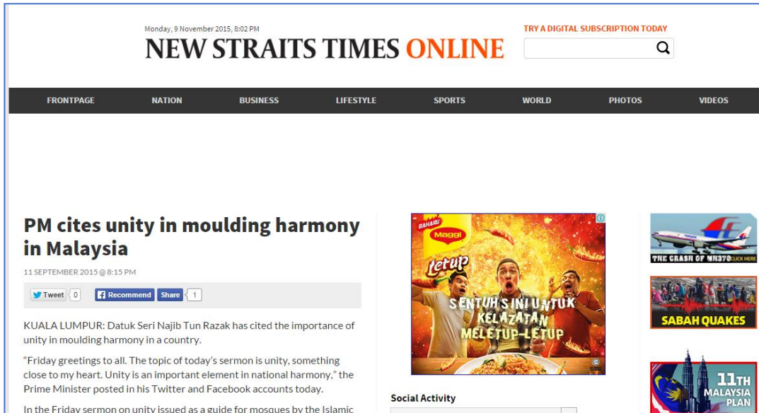
Figure 1: National Harmony