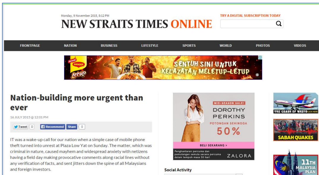
Figure 8: Nation Building