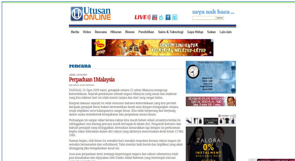
Figure 5: 1Malaysia Unity