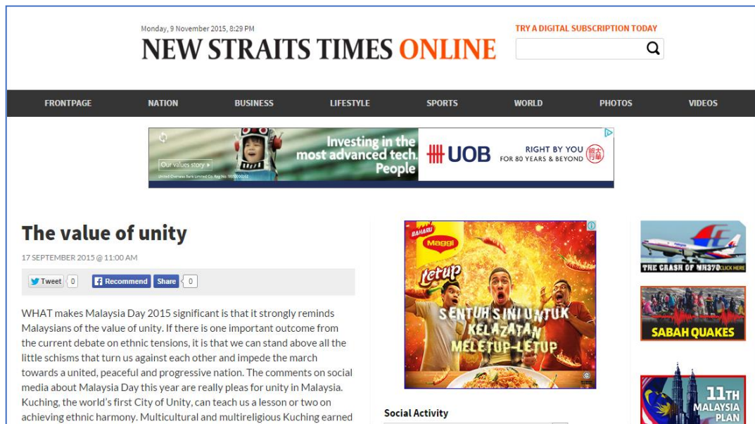
Figure 6: The value of unity