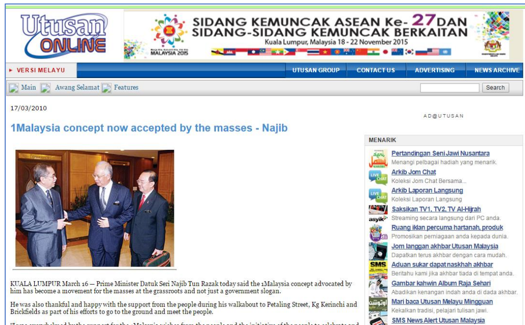
Figure 7: 1Malaysia now accepted by the masses

While, Utusan Malaysia's news refer to the initiatives taken by the 6 th Prime Minister to sustain the degree of unity among people. The concept is to strengthen all the efforts made by the previous Prime Ministers as an ongoing effort that being continued since independence 1957. Anderson (1991) stated that attention on the multi ethnic empire is the best way to achieve nationalism. Nevertheless, achieving nationalism in the multi ethnics country is complex due to the difference of culture and believe. This the reason why the country has to focus on the unity before achieving the nationalism stage. As the 1Malaysia slogan says ' people first, performance now', 1Malaysia is aim to unite the people regardless of ethnic diversity or religious believe can be seen as the government took many initiatives to get its people to stand together. Dato' Seri Najib explained that the 1Malaysia concept was implemented under two main aspects: firstly, the assimilation of core elements of unity and, secondly, the assimilation of the aspiration values. This is an essential apart from the principles of nationhood which is based on the Federal Constitution and National Ideology. This is the important aspects that need to take into consideration in creating the unity.