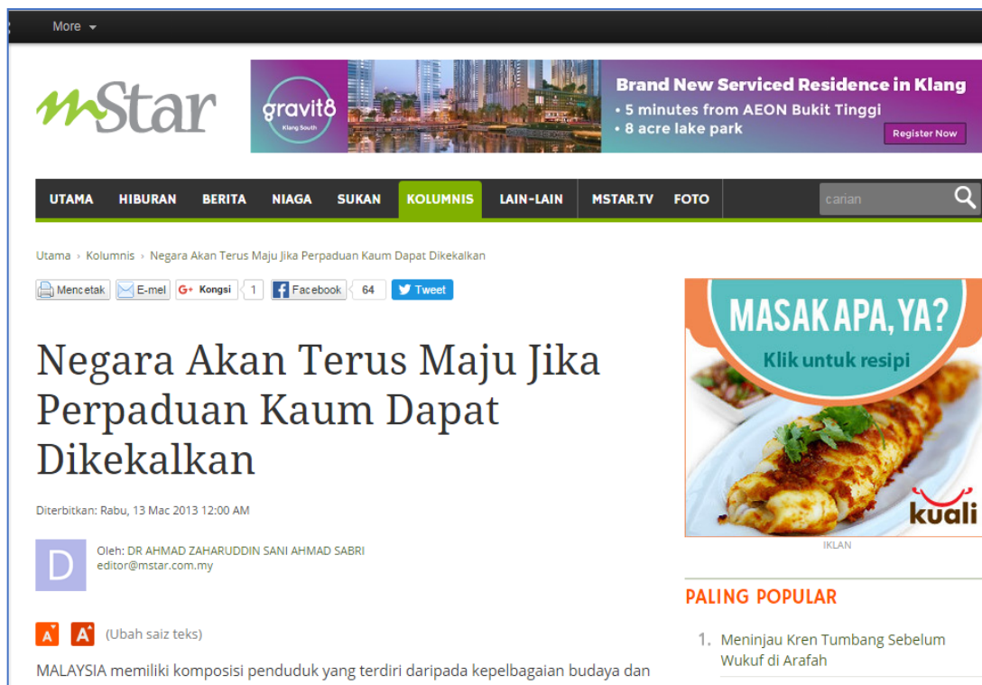
Figure 3: Racial Harmony

Based on the above samples, it can be seen that the Star is trying to promote and strengthen the racial harmony in Malaysia. The main objective of 1Malaysia is to foster racial harmony and print mainstream media is promoting the racial harmony among Malaysians. Anderson believes that print capitalism is needed to emerge the nation and claims that it was print capitalism which allowed for the development of these new national cultures and created the nation eventually. Malaysia government is trying to utilize the print media to urge its citizens to create racial harmony despite the racial differences in order to successfully build the nation that they desire through the 1Malaysia concept.