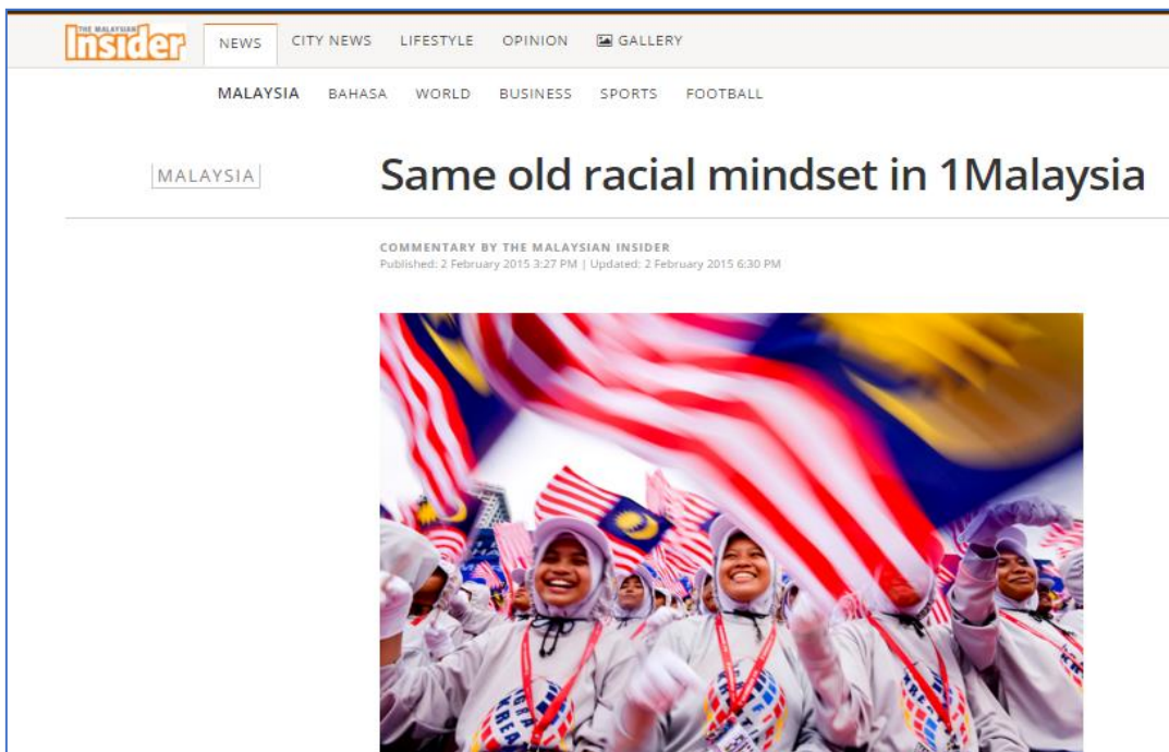
Figure 2: Same Old Mindset in 1Malaysia