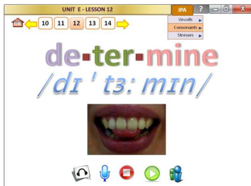
Figure 4. Text + Sound + Mouth Movements + Phonetic Symbols (TSMMP)