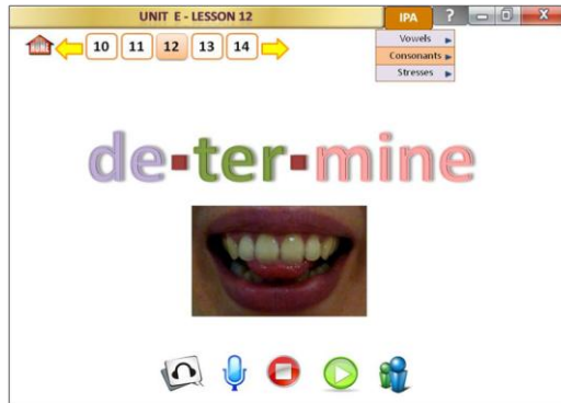
Figure 2. Text + Sound + Mouth Movements (TSM)