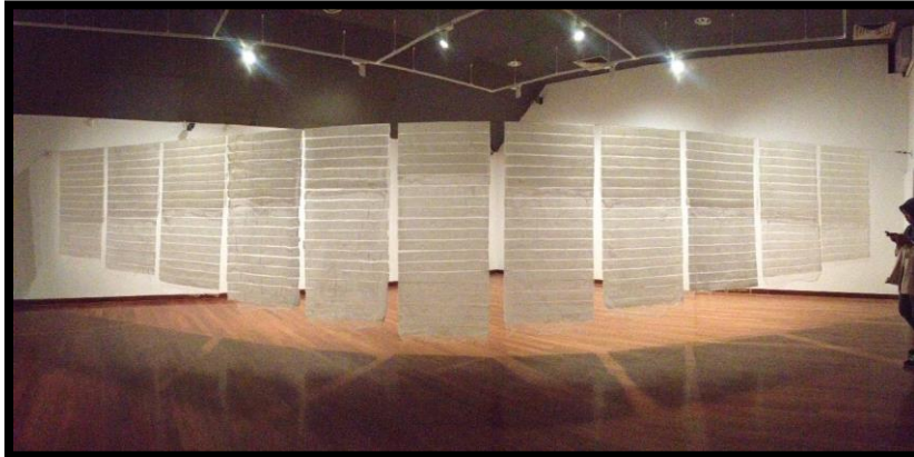
Figure 5: Saiful Razman Mohd Kassim. (2016). Kau datang untuk menghilang . [Various Dimensions]. Kuala Lumpur: National Art Gallery.

mixed media. Meanwhile, in 2013 and 2016 The theme of 'Free' by Mohd Fuad figure 4 was well known with the work entitled ' Pembukaan ', 2013, multiple dimensions. Various dimensions and Figures 5 the latest work of Saiful Razman Mohd Kassim's ' Kau Datang Untuk Menghilang ' 2016. Organizing two daily objects into one layer built from medical gauze fabric to trap and recognize toilet tissue. The modification of the appearance and physicality of the object was based on active behavior for me to understand the meaning of existence, memory and loss, (Mohd Kassim, 2016).